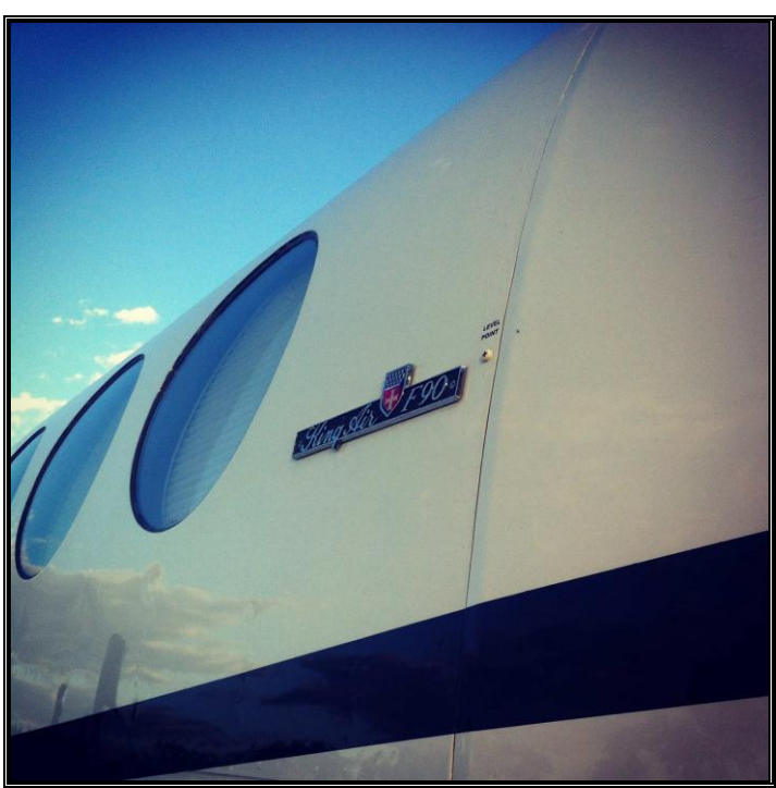
The preceding preliminary information is for discussion purposes only, is subject to verification by purchaser, is subject to change without notice, and is not to be considered a representation of this aircraft. Interested parties should rely upon their own inspection of the aircraft and its records. Aircraft is offered subject to prior sale or withdrawal from market.